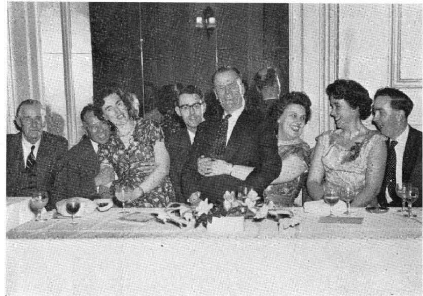
A group of the not quite so young (careful!) posed for the photographer.