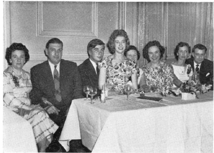
A group of the younger set waiting for the dancing to begin.